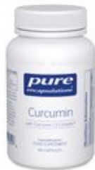
Curcumin 60 capsules £22.46

Curcumin supplements had similar positive effects in earlier studies on glaucoma