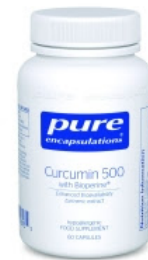
Curcumin 500 with Bioperine 60 capsules £37.96